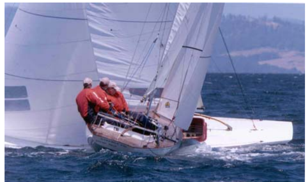
DragonBeat20 is produced in two parts for ease of e-mail transmission