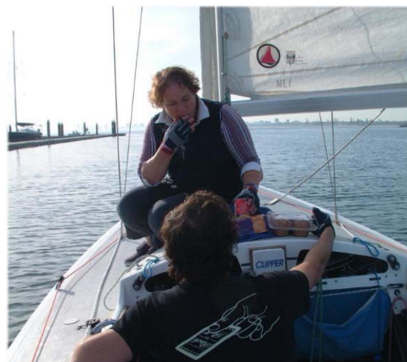
The crew on Tarakone contemplates the strategy to the next mark over a bikky and cheese.