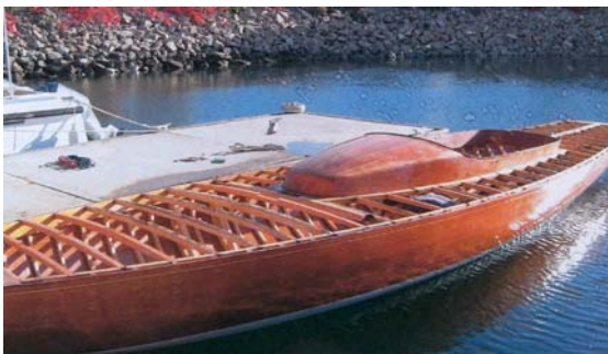
4. Deck off and checking/ replacing the deck beams.