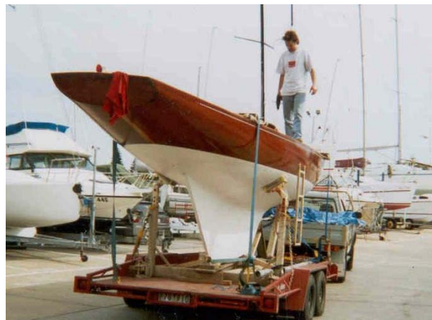
2. Upon arrival at the Cruising Yacht Club of South Australia – an unusual trailer set up but successful for the 800km journey to Adelaide