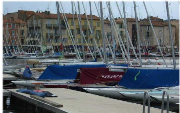
Dragons line the marina in the inner harbour at St. Tropez.

St. Tropez itself is a quaint little seaside port that has grown big. It has many shops of the exclusive clothing labels, all mixed up with restaurants, hotels and bars. And artists working and displaying their works around the harbour-side.