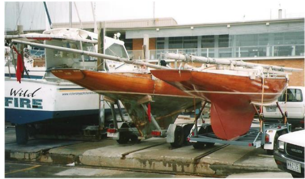
1. Sari alongside Avante at Royal Brighton.