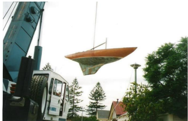
3. Being lowered into her new home