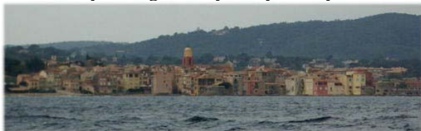
St. Tropez from the sea.