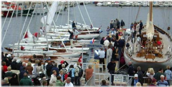
Event sponsor Hanseatic Lloyd Shipping had their yacht moored along side the 'dignatories' Dragons, Kings, Princes and World Champions.