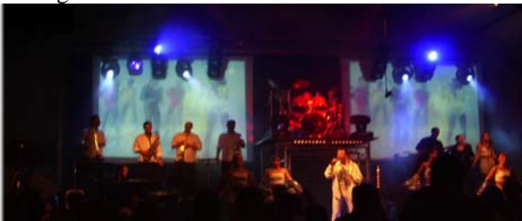
A full-on rock concert was put on in the event marquee.

The party that night was allegedly going to be dancing with a 1960s theme. It turned out to be full-on Rock concert. Wow. And event sponsor, Harboe beer, put on their product, free-of-charge! This regatta was certainly starting well.